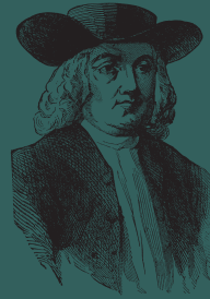
William Penn Founder of Pennsylvania

Sign up for our mailing list to stay up-to-date about legal developments, opportunities to comment on legislation, and current events.